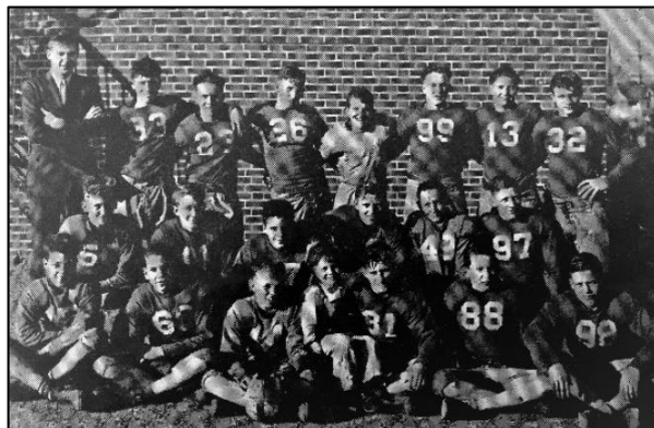
Urbandale Football Team 1939

effort to contact the graduates of Urbandale High School living in all 50 states and more than 20 foreign countries. More than 2,500 graduates are currently listed as members.