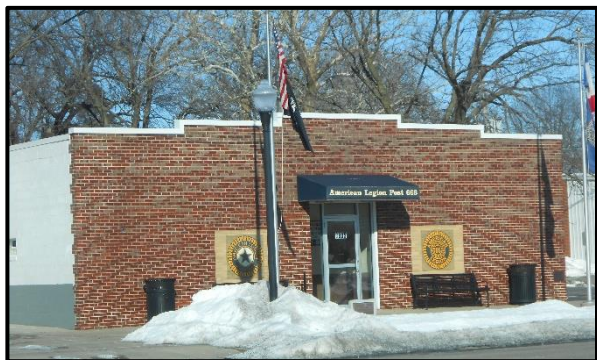
November 1944 issue - The Blue Jay Chatter

The biggest accomplishment was the building of the Legion Hall described in the November 1944 issue of Blue Jay Chatter.